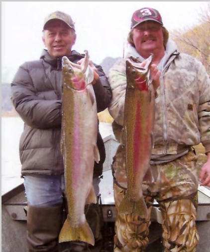
Fishermen Pops & Woody with an exceptional catch!